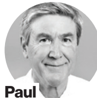
Paul C. W. Davies

Fellow in the British Academy and member of the Royal Institute of Philosophy, is a prolific writer whose works engage comparative theology, religion and science, philosophy of religion, and Christianity and the modern world.