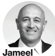
Jameel Sadik “Jim” Al-Khalili

Conversations on Religion, Ethics and Science (CORES) is made possible through a grant from the John Templeton Foundation to the Arizona Center for Christian Studies and subcontracted with the Center for the Study of Religion and Conflict at Arizona State University. The opinions expressed are those of the speakers and do not necessarily reflect the views of the John Templeton Foundation, Arizona Center for Christian Studies, Arizona State University, or co-sponsors.