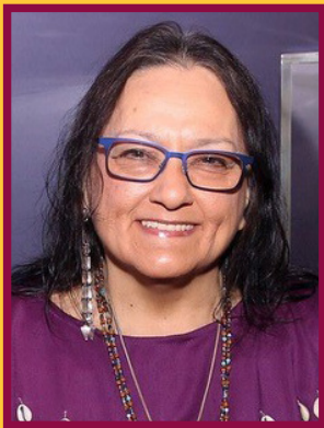
Suzan Harjo Cheyenne & Hodulgee Muscogee Writer/Curator/Policy Advocate/President Morning Star Institute